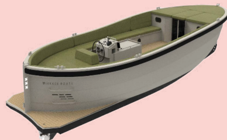
DAMSKO 1000 • CABIN