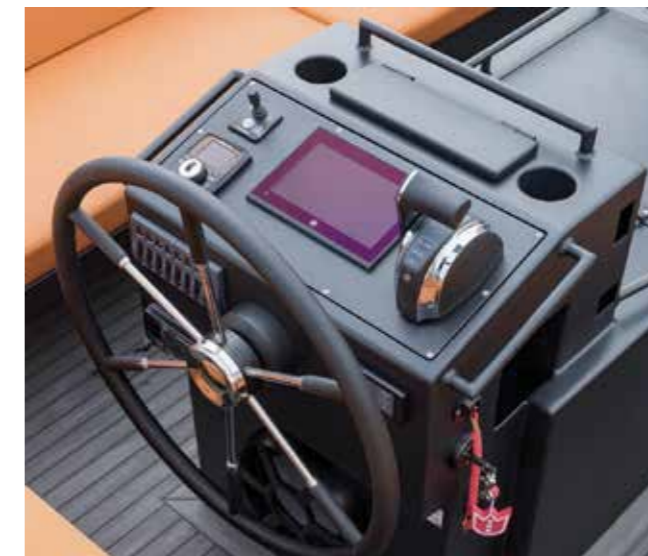
Console + GPS