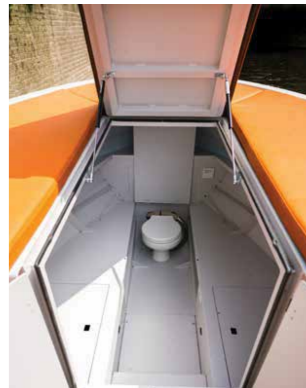
Cabin + toilet