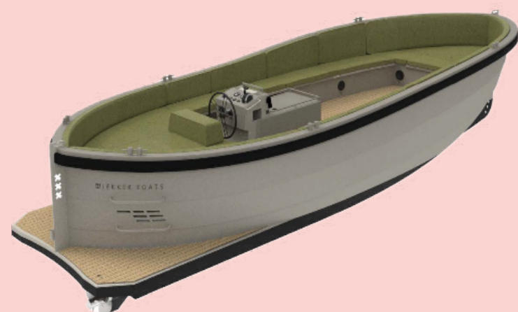
DAMSKO 1000 • OPEN